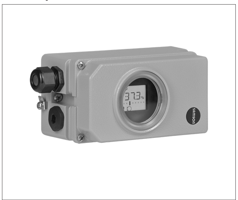
Type 3730-3 Electropneumatic Positioner