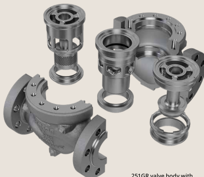
251GR valve body with different trims